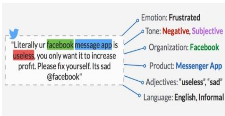
Figure 1: Understanding Language

syntactic structure are responsible for meaning extraction from input. Next step is discourse integration where the meaning of sentence is tried to be extracted using the previous sentence meaning. Final step is pragmatic analysis. In this analysis, the main emphasis is on what was said is reinterpreted on what does it actually mean. After all these steps the meaning of sentence is known to machine and it finds answer to user query and passes it to Natural language generation (NLG) for generation of final output. Natural language processing (NLP) is used in many chatbots for effective communication with humans. Below figure 1 shows Basic working of chatbot using Natural language processing (NLP).